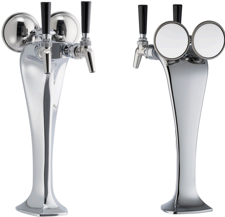
4085-2BIM, CB-2BIM shown