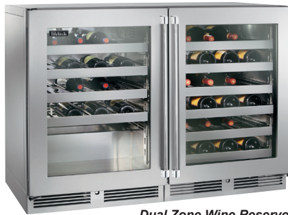
Dual Zone Wine Reserve HC48WW